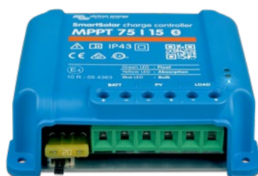
SmartSolar Charge Controller MPPT 75/15