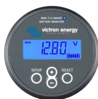
Bluetooth sensing BMV-712 Smart Battery Monitor