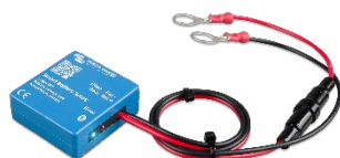
Bluetooth sensing Smart Battery Sense