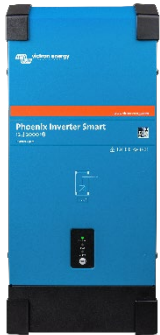
Phoenix Inverter Smart 12/2000